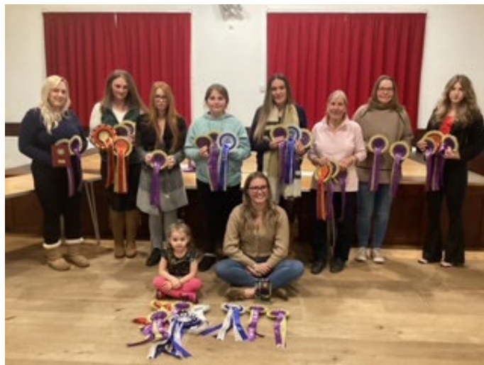
U.P.F.C. Horse and Pony Show trophy winners. Congratulations to all.